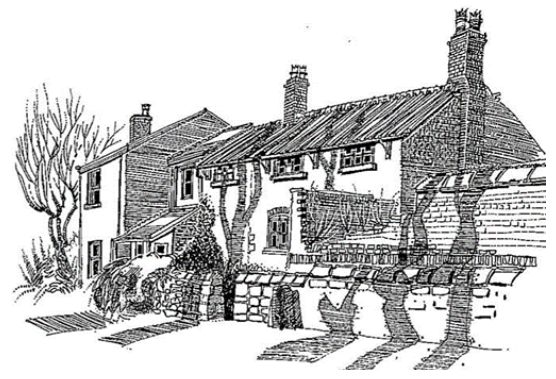
Drawing of a house inside Lunt Village Conservation Area