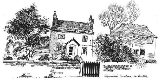
Drawing of a house inside Carr Houses Conservation Area