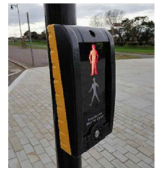
Typical Example of a pedestrian signal push button

Lulworth Road and Weld Road Junction Upgrade of existing traffic signals to include pedestrian crossings with tactile paving and push buttons across Weld Road and Lulworth Road