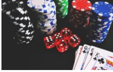
Gambling Act 2005

There is one gambling law in the United Kingdom. It is called the Gambling Act 2005 .